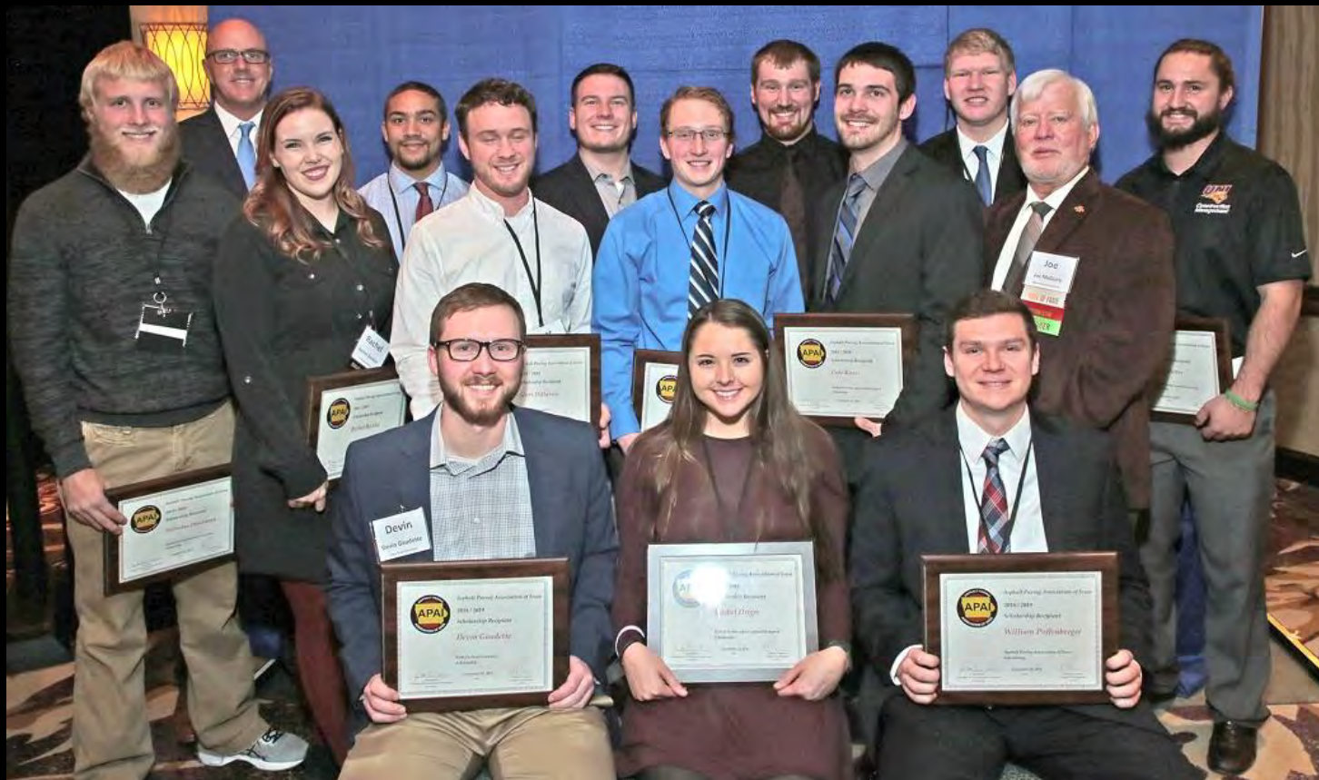
2018 APAI Scholarship Recipients