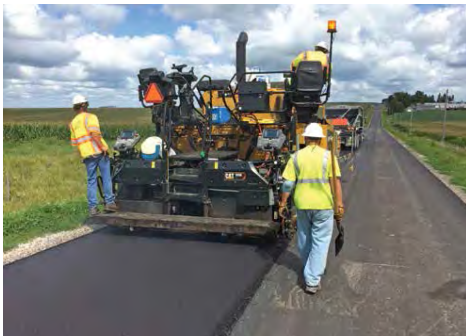
Tri-State Paving employees in Crawford County.

Iowa’s asphalt industry has been progressive in welcoming minority workers, particularly Hispanic workers, to our paving crews and leadership roles. This commitment needs to continue and progress. Women have always been present in our industry, but recent trends have seen a strong rise in the numbers of women being hired by Iowa contractors. The