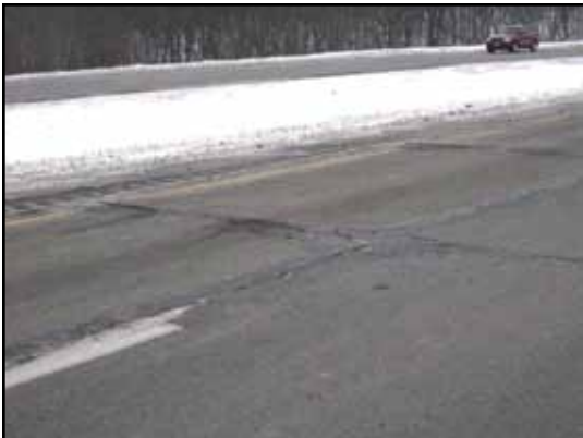
PCC joints blowing up through the asphalt overlay on Highway 30 outside of University Ave Exit Ames.

These stresses lead to thermal-cracking, blown-up joints, pot-holing, and quickly deteriorating pavements. The weakened surface layer now allows water infiltration down into the already deteriorated PCC pavement, exacerbating the problems. Asphalt gets a huge black eye from composite pavements. The traveling public